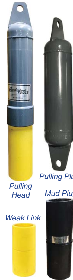
Pulling Plug Pulling Head Weak Link Mud Plug