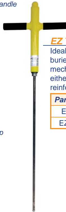
Heavy Duty with Standard Handle